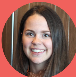
ANMF Climate Change Officer TOPIC: Health and Climate Change Action