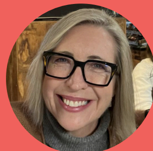
Director - Reville Strategy TOPIC: Grass Roots Organising

Full list of speakers and topics on the back