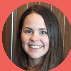
ANMF Climate Change Officer TOPIC: Health and Climate Change Action