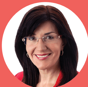
State Health Minister TOPIC: Key Priorities in Health