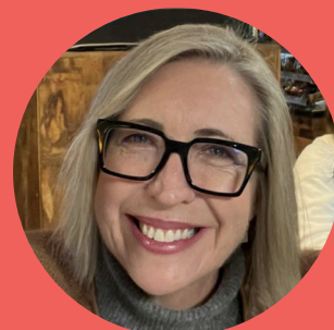
Director - Reville Strategy TOPIC: Grass Roots Organising

Full list of speakers and topics on the back