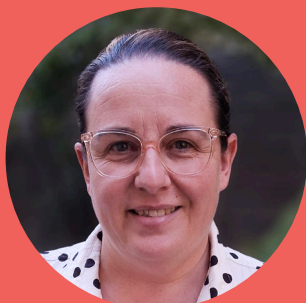
Acting ANMF Tas. Branch Secretary Conference Host & MC